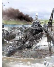
7 Pearl Harbor Day---